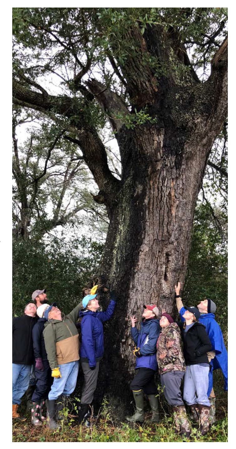
Dow and The Nature Conservancy team members assessing forest growth at The Nature Conservancy's Brazos Woods Preserve in West Columbia, Texas.