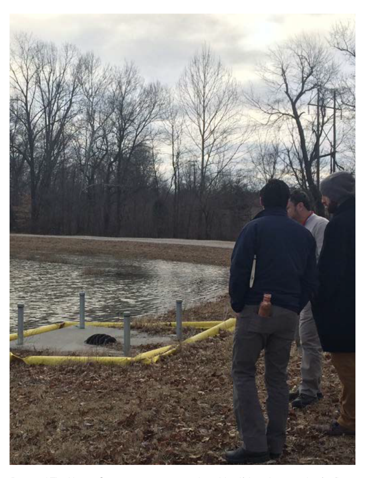
Dow and The Nature Conservancy team members identifying plant species for fire retention pond plantings in Elizabethtown, Kentucky.