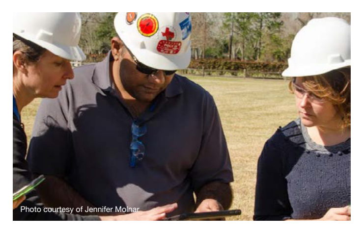
Dow and The Nature Conservancy team members using the ESII Tool at freshwater pumphouse in Lake Jackson, Texas.