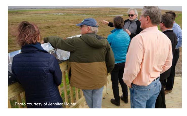
Dow, The Nature Conservancy, and external partners touring one of Dow's closed landfills that was converted into a wetland.